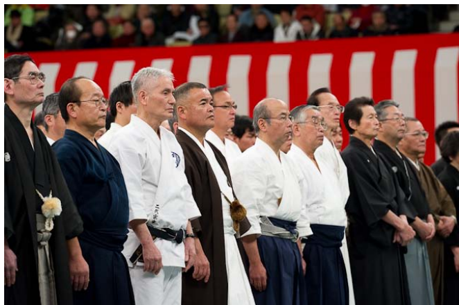
33 rd anniversary Nihon Kobudo Kyokai opening ceremony

The Nihon Kobudo Kyokai is dedicated to preserving the ancient martial traditions of Japan, and sponsors annual exhibitions featuring recognized systems or schools, in order to promote awareness of this unique legacy.