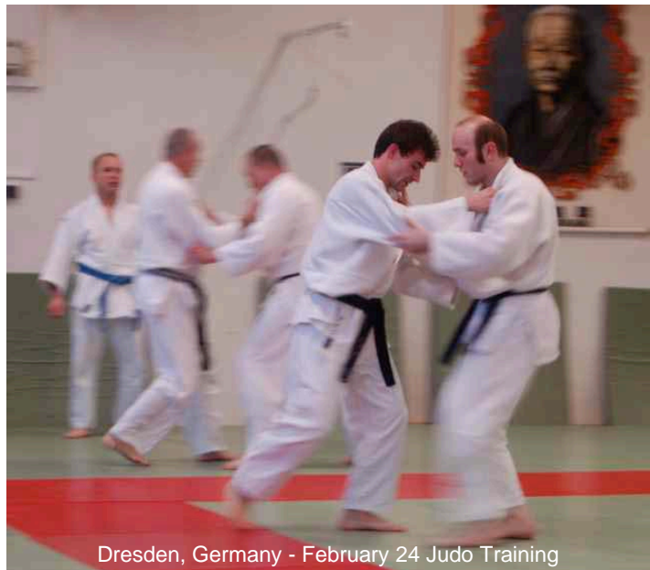
Dresden, Germany - February 24 Judo Training

News & photos from February workshops held in Denmark, Germany and France. continued on page 2