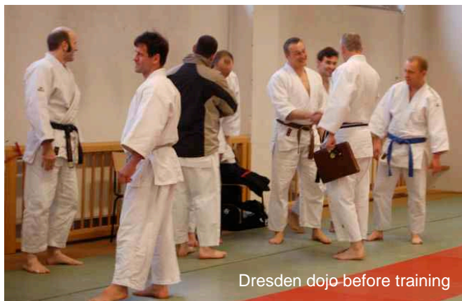
Dresden dojo-before training

February 24 th the Dresden Jujutsu and Judo PSV Club sponsored a Judo and Nihon Jujutsu workshop for members and friends from Saxony, Berlin, and Hessen.