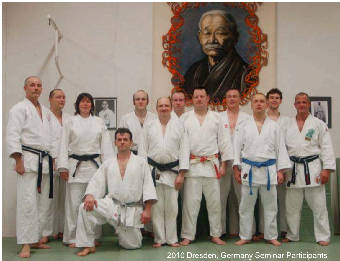
2010 Dresden, Germany Seminar Participants

Information about Judo & Nihon Jujutsu in Dresden at: http://www.jujutsu-judo-dresden.de/