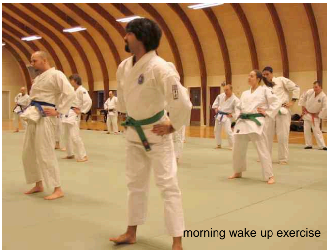
morning wake up exercise

Training continued with sessions on Saturday and Sunday. All Participants worked hard to perfect basic and advanced throwing ( nage-waza ), grappling ( ne-waza ), and a variety of techniques that comprises the Nihon Jujutsu syllabus.