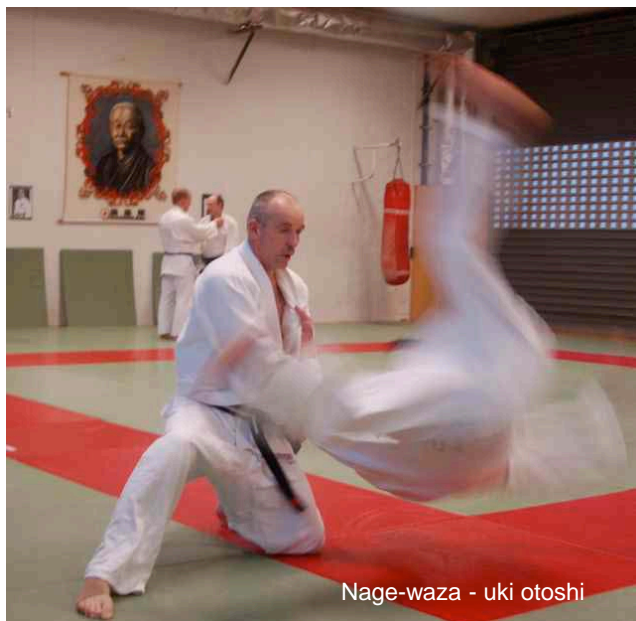
Nage-waza - uki otoshi

The workshop was dedicated to advanced training, and participation was limited to senior Dresden Jujutsu and Judo PSV Club members and friends.