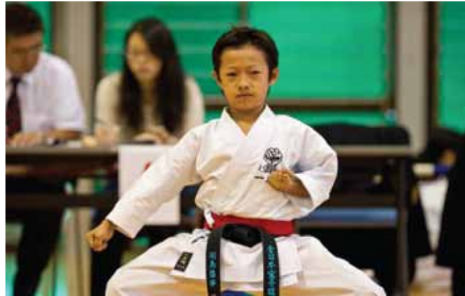
Karate-do kata contest participant, Jr. division

Tokyo , More than two years in the planning, the first Kokusai Budoin, IMAF All Japan Open Championship was held at the Bumbo Sports center in central Tokyo on September 23rd.