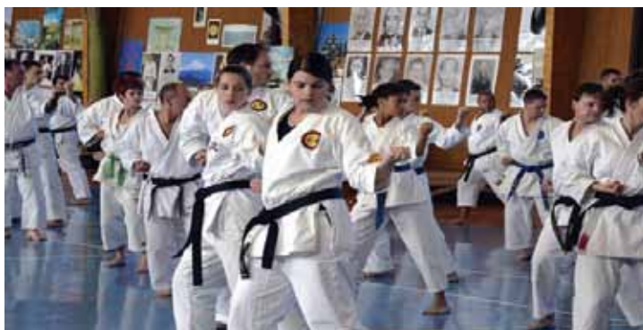
More than 300 participants at the International Congress in Exincourt

http://www.lepays.fr/sport/2011/10/21/congres-international-a-exincourt