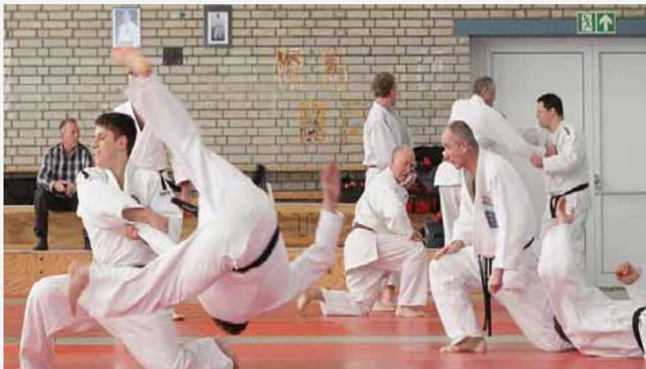
Judo Nage no Kata, uki-otoshi (floating drop) Riesa-doj, Germany March 2011