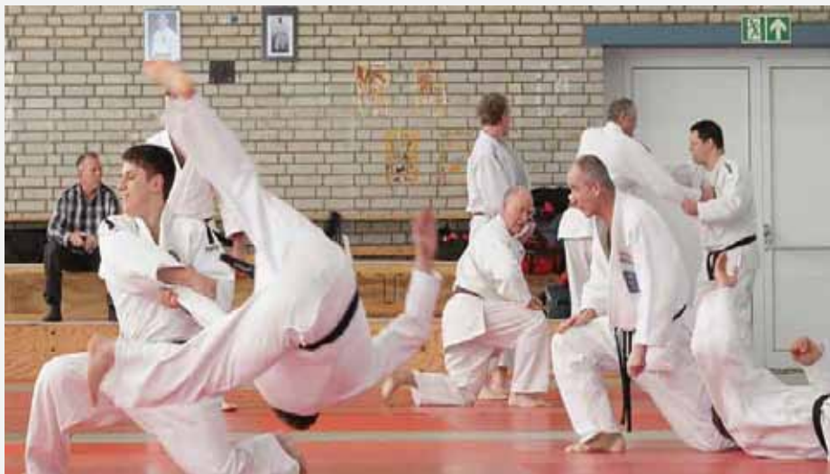
Judo Nage no Kata, uki-otoshi (floating drop) Riesa-dojo, Germany March 2011