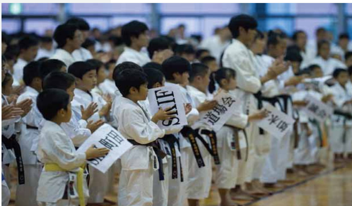
Ryushin Shouchi Ryu Kobudo Demonstration

More than 600 men, women, and children participants and spectators gathered for the first open Karate-do competition in Tokyo. Competitors at the opening ceremony.