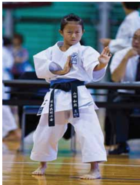
Karate-do kata contest participant, Jr. division

600 men, women and children from five prefectures and seven cities across Japan, as well as a number of international participants, gathered to compete for top honors.