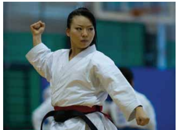
Karate-do kata contest participant, adult division