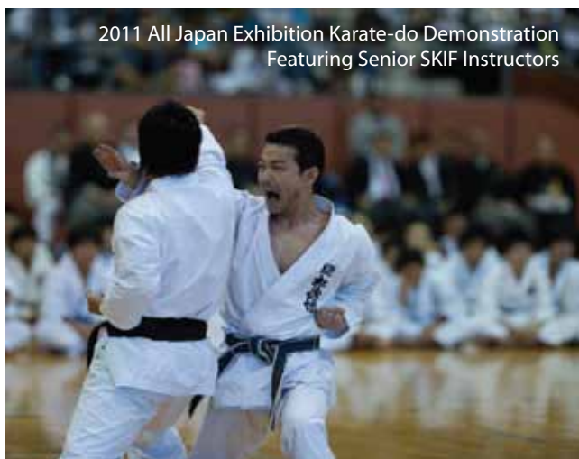
2011 All Japan Exhibition Karate-do Demonstration Featuring Senior SKIF Instructors

Details of all events at: www.imafr.com/events.html