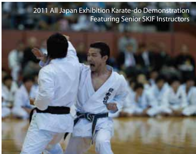
2011 All Japan Exhibition Karate-do Demonstration Featuring Senior SKIF Instructors

Details of all events at: www.imafr.com/events.html