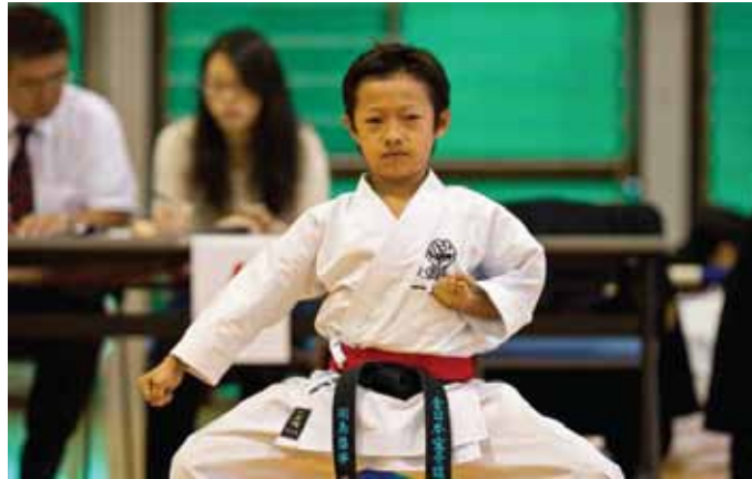
Karate-do kata contest participant, Jr. division

Tokyo , More than two years in the planning, the first Kokusai Budoin, IMAF All Japan Open Championship was held at the Bumbo Sports center in central Tokyo on September 23rd.