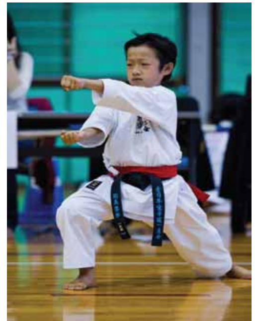
Karate-do kata contest participant, Jr. division

The opening ceremony began at 10:00 with addresses by a variety of dignitaries. The Jr. and adult kata competition was held from 10:30 until the mid-day break at 13:00.